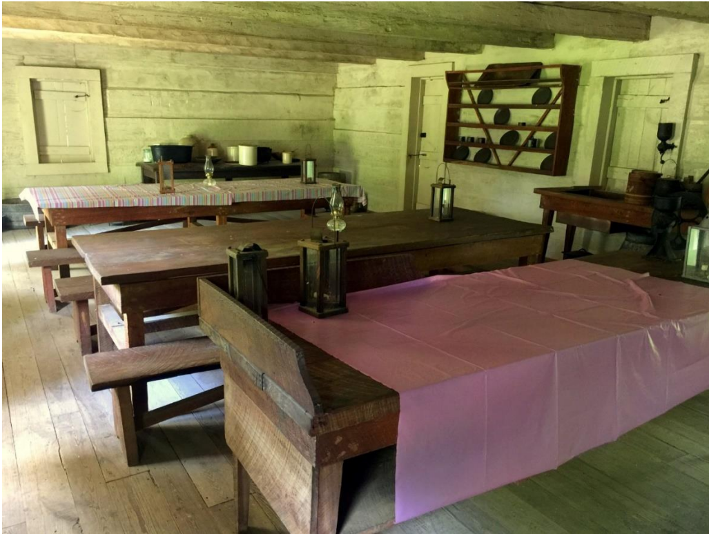
Interior of Fort Jesup Kitchen, 2017.