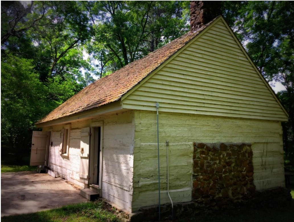
Fort Jesup Kitchen, 2017.