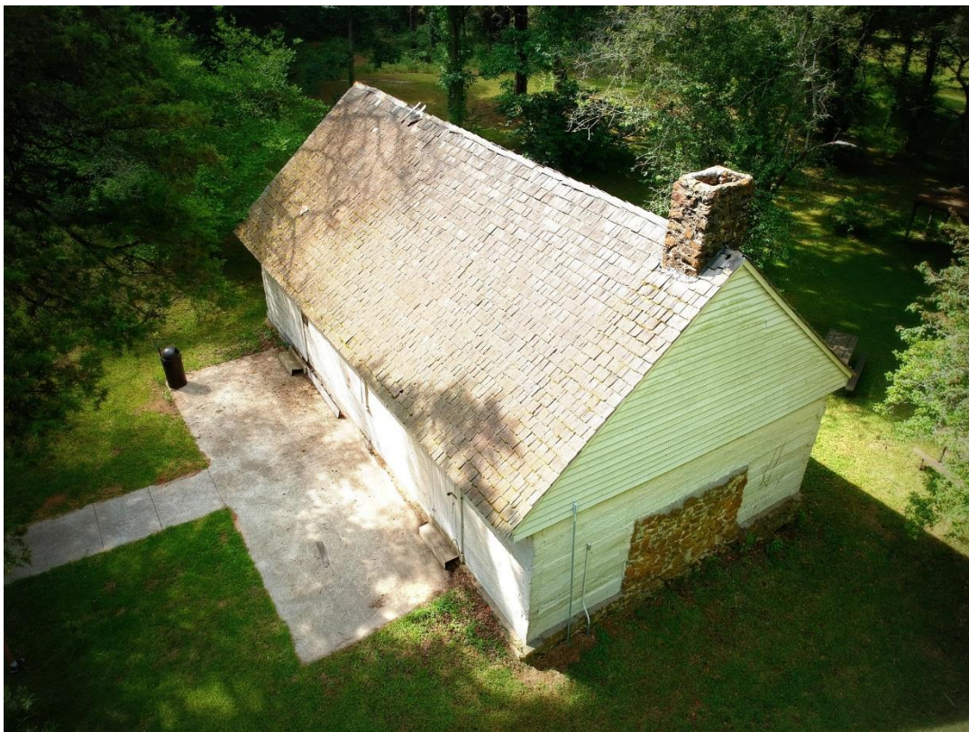
Fort Jesup Kitchen from above, 2017.