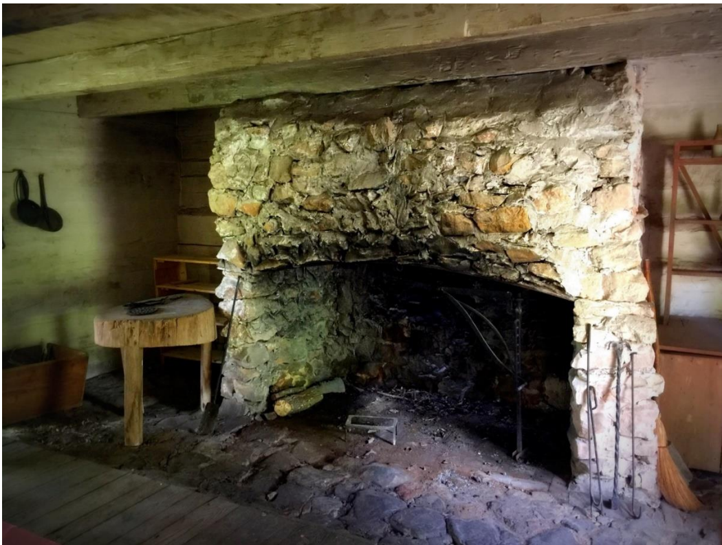
Fireplace and hearth, 2017.